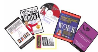
Reference Cards, Books, CDs, and Other Self-Paced Learning Tools

All tools and resources are available at http://www.springboardtraining.com/products/invest-success